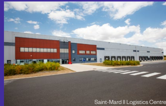
Saint-Mard II Logistics Centre