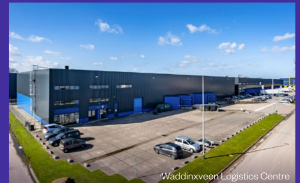
Waddinxveen Logistics Centre