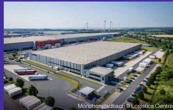
Mönchengladbach III Logistics Centre

Choosing locations close to large consumer populations helps our customers meet rising delivery and service expectations. It also provides greater resilience for their supply chains and provides opportunities to be more sustainable.